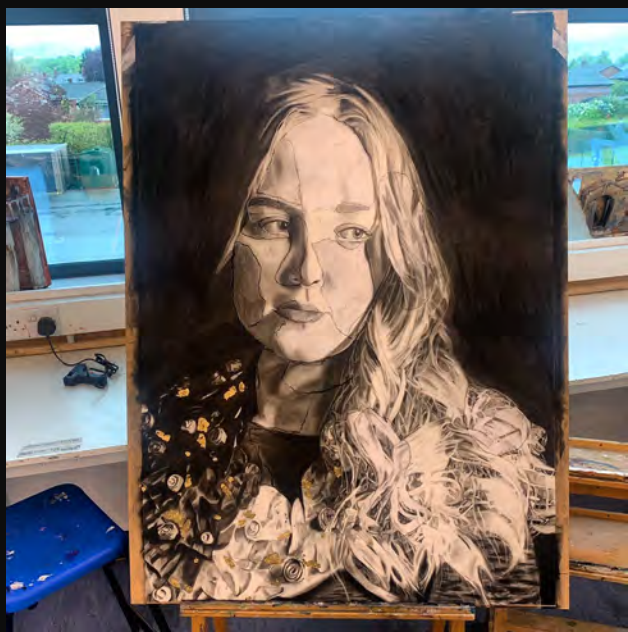
Gallery – A Level Art