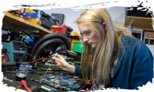
Design, Engineering & Technology